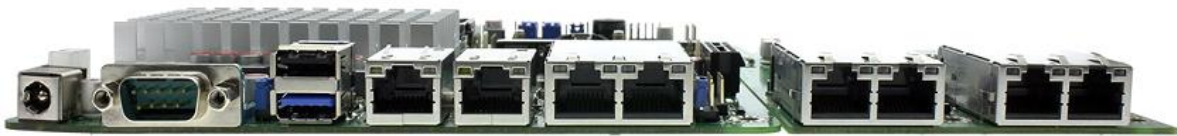
Rear I/O example with NF9HB-2930 or NF9HG-2930 motherboards.