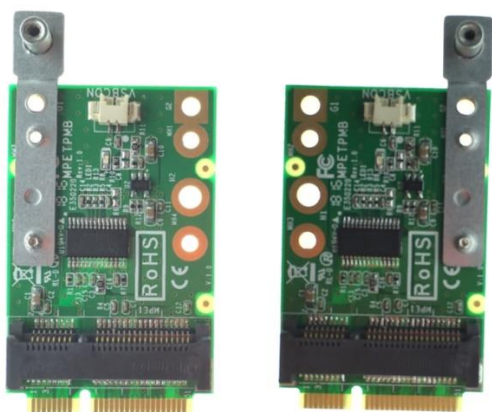
Full-size bracket, for left or right mount

WARNING: Plugging into non-compatible motherboard may cause damage