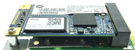
With mSATA SSD installed