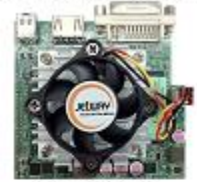
ADE4NV13M NVIDIA 610M GPU