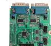
ADE4COMCB 4-port RS232 Serial