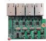
ADE4RTLANG 4-port Realtek LAN