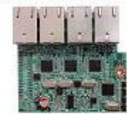
ADE4INLANG 4-port Intel LAN