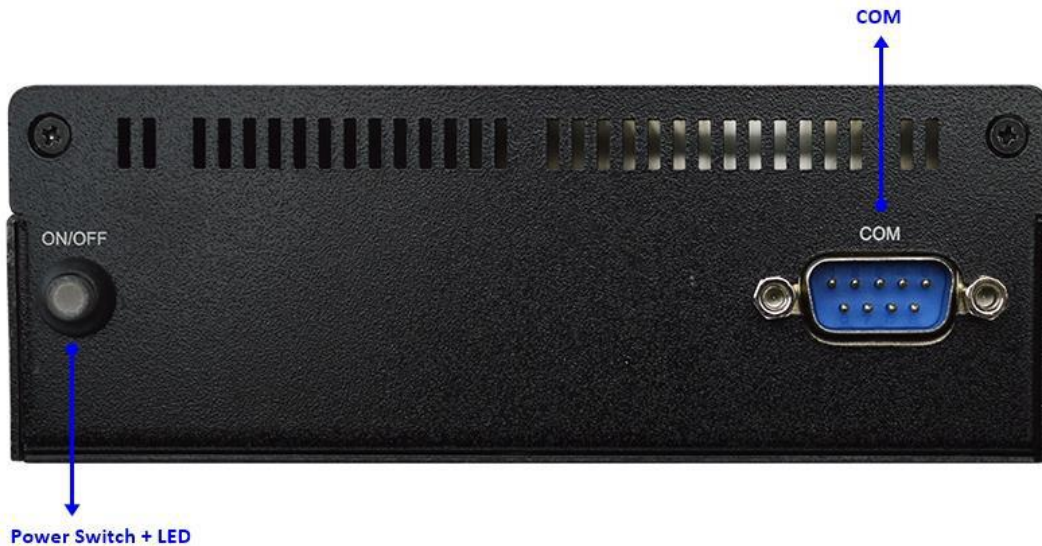
Power Switch + LED